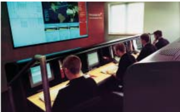
Global Operations Centre (GOC)

Sign up for the SkyScan AV service and you'll receive unprecedented levels of technical and customer support through the MessageLabs Global Operations Centre (GOC). Based in the UK, the GOC supports customers worldwide 24x7x365, has multi-lingual abilities and is backed up by local operations in key locations. Additionally, our support technicians monitor the network and the e-mail passing through the system to ensure the SkyScan service is continually updated. So you don't have to worry about a thing.